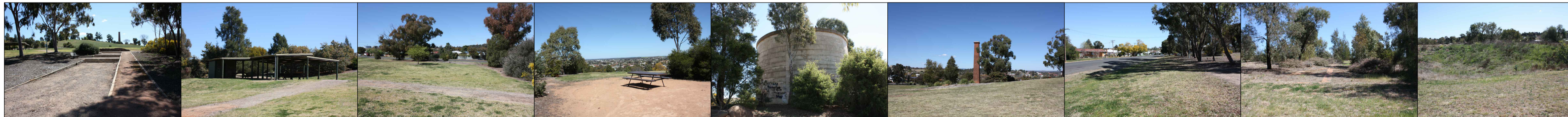
Photo 1: Existing park entry off Wentworth Street which needs maintenance and new plantings Photo 2: Existing BBQ shelter requires work and a new BBQ to replace the previous one. Photo 3: Natural slope would suit an amphitheatre Photo 4: Picnic area atop the hill is underutilised Photo 5: Existing water reservoir could be used as an artspace. There are panoramic views but those to the south are superior Photo 6: Existing Chimney to be included in historical interpretive walk Photo 7: Underutilised parking area along Wentworth St Photo 8: Degraded garden that could be used by the arid garden club Photo 9: Detention basin