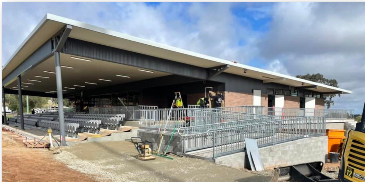
Photo 9: construction progress of the grandstand and amenities block at Spicer Oval (Al Ryan)

The construction of the new amenities and grandstand at Spicer Oval is well advanced. Parkes Boars are charging towards the finals of the 2022 New Holland Cup and are hopeful that the completion of the construction works coincides with the first match at the ground – the Grand Final!