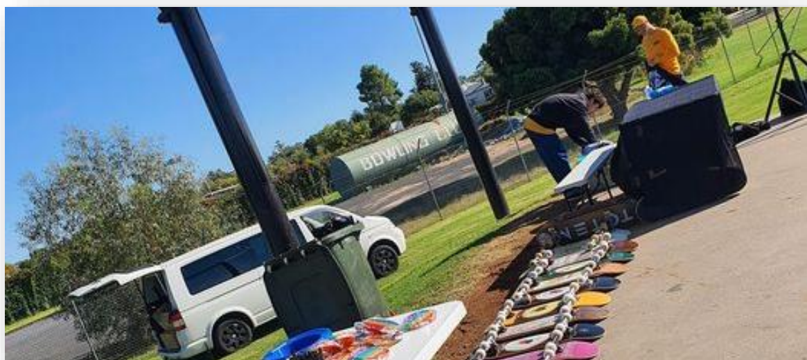
Photo 5 Skate Workshop at the Parkes Skate Park

Works are still planned by Council to expand the Skate Park with a new pump track to the North of the existing skate park. On Sunday 10 April 2022 a skate workshop was held at the Parkes Skate Park as part of Youth Week.