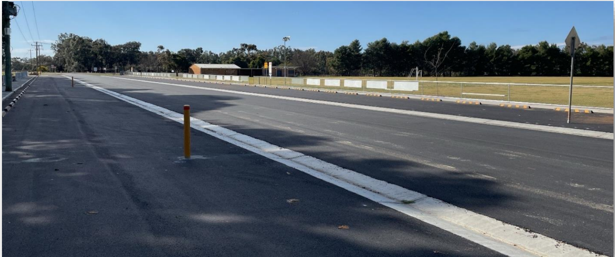
Photo 4 Drainage, carparking and footpath works at Harrison Park

The upgrade to the carparking areas and drainage improvement works along Nash Street were almost complete at the end of the fiscal year. The $680k project will significantly improve the amenity of the area and was long overdue.