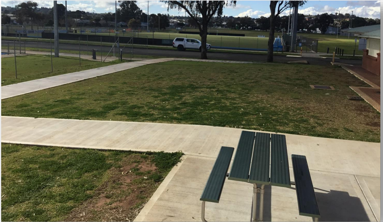
Photo 3 New Access Path to McGlynn Amenities

Parkes Hockey, Netball and Cricket all use the facilities at McGlynn Park. New concrete paths from Baker Street to the amenities building were constructed under the Local Roads and Community Infrastructure grants program during 2021-22.