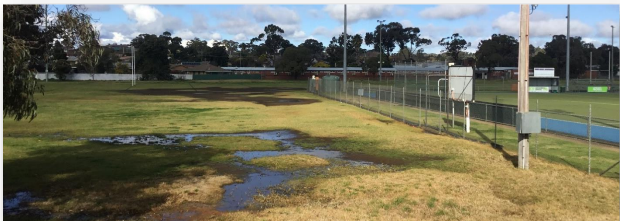
Photo 2 Drainage issues around Stephen Davies Field

The field's base and surrounding areas has begun to deteriorate resulting in depressions in the surface. Some minor repairs have been made; however, the surface will require a major upgrade. Parkes Shire Council allocated funds from the Resources for Regions grant program to replace the field during 2022-23. However, the drainage issue must be resolved before the synthetic field is upgraded.