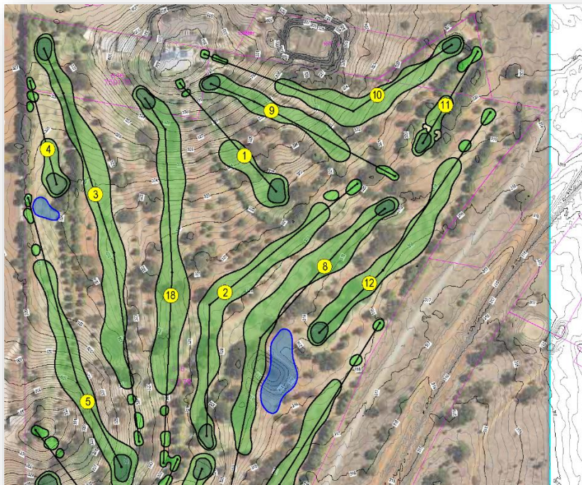
Photo 11: Masterplan of the proposed redesign of the Parkes Golf Course

The Parkes Golf Club has been enjoying a resurgence in numbers and fortunes. Golf was one of the few sports that could be played through the Covid-19 restrictions and as a result, enjoyed increased membership and participation in competition events. Plans to redesign the course have been delayed but look to start in September 2022. The changes will see the course layout raised to a par 72 championship level.