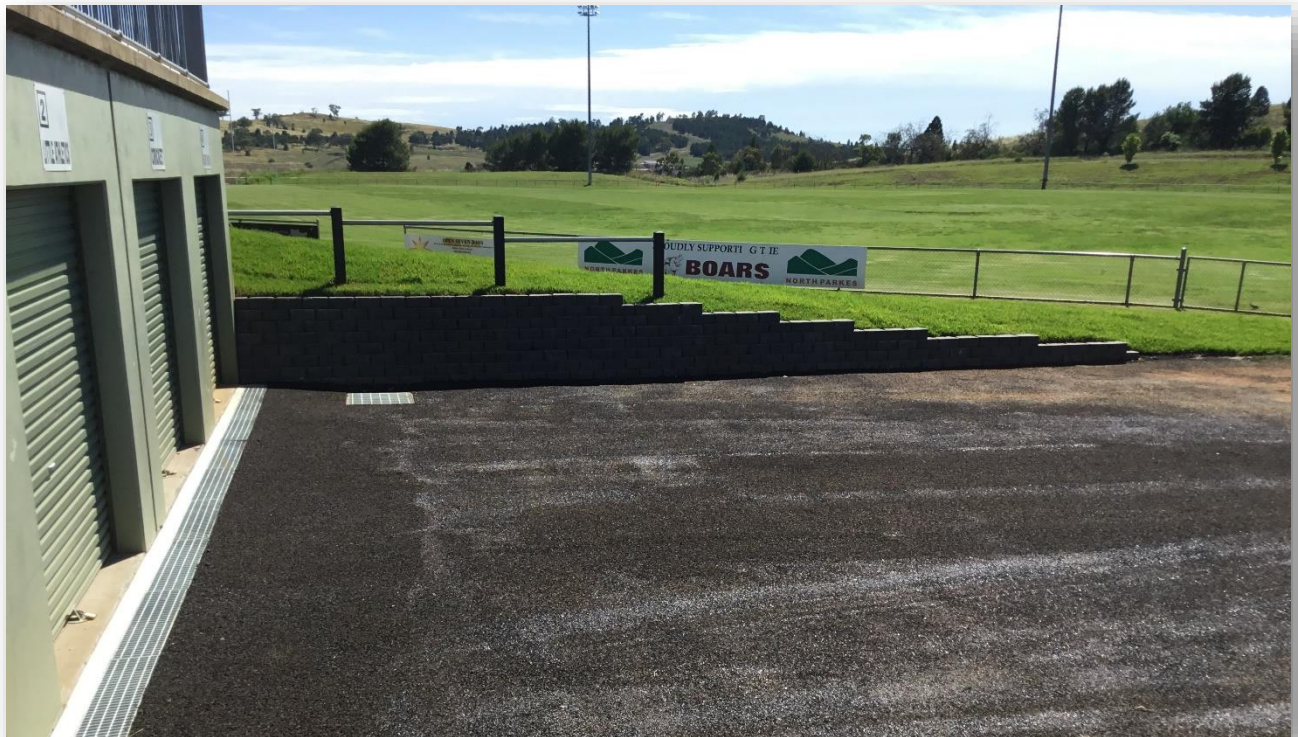
Photo 6 Drainage improvement work at Northparkes Oval Storage Sheds

Parkes' most used facility saw the Panthers share the ground and facilities with the Parkes Boars Rugby Club during the Winter season although the Boars have switched their training ground back to Spicer Oval During Summer, Parkes Little Athletics and Cricket call Northparkes home. Drainage works were completed by Council's contractor at the area around the storage sheds and at other areas around the precinct. The project to build a BBQ shelter at the ground was shelved by Council and the funding diverted to the drainage and parking project at Harrison Park.